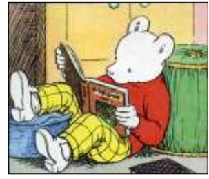
He settles down, the books to read He sent for and has now received