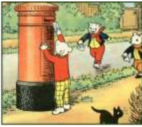
The chums run down to catch the post. There's no doubt now what they want most